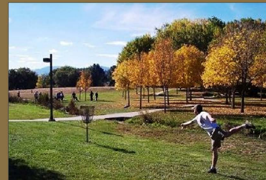
Disc Golf Course