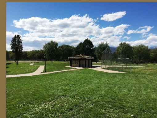
Restroom / Baseball Backstop