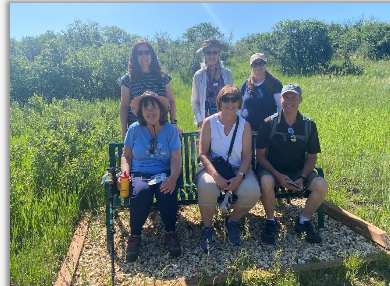
Flora & Fauna Walks