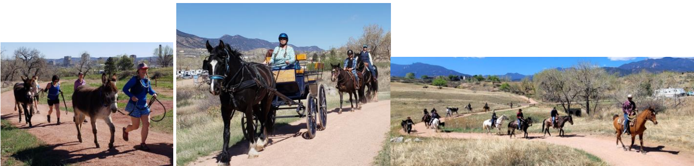
Friends of the Equestrian Skills Course – Fundraiser Event – Bear Creek Regional Park