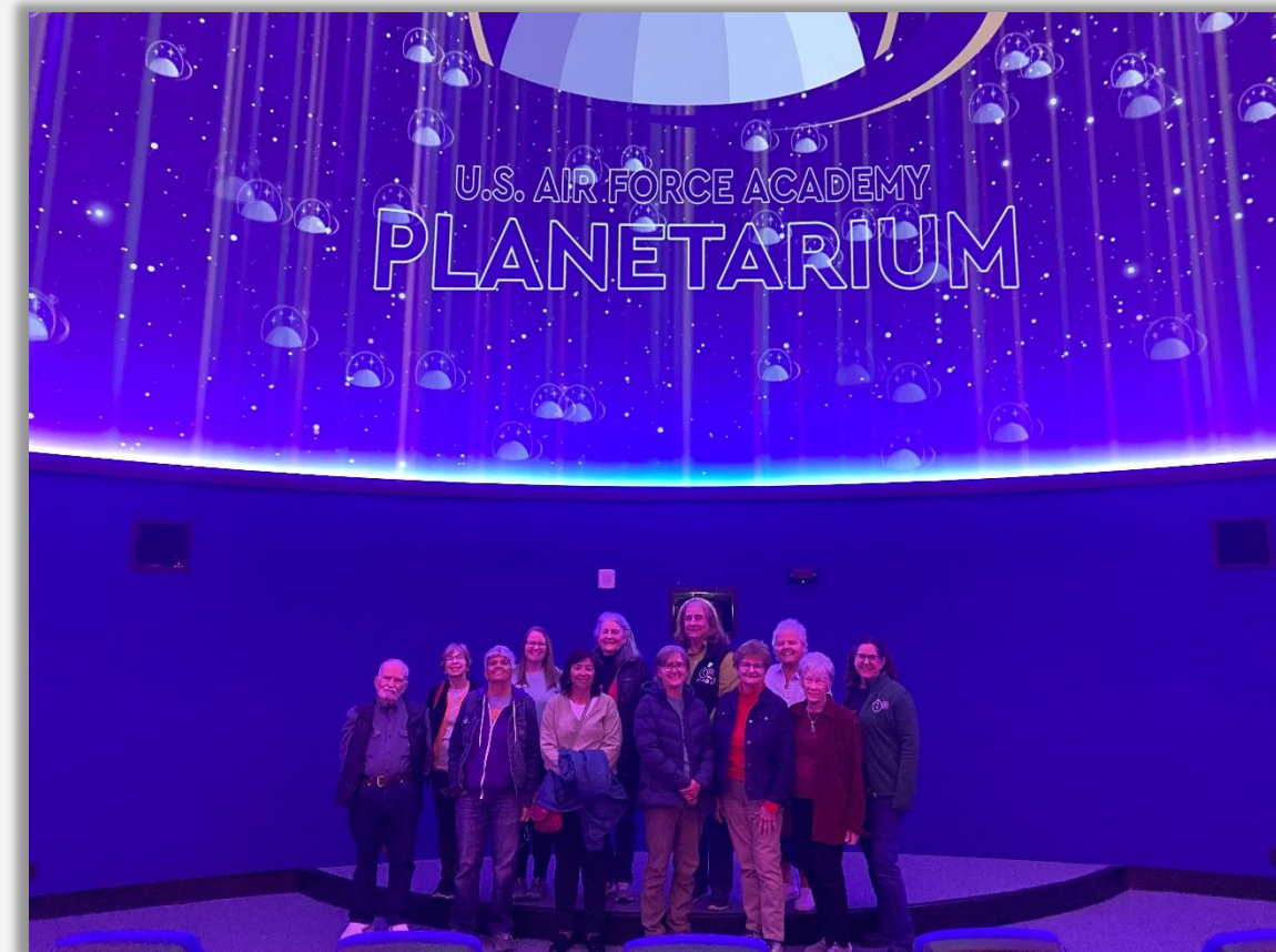
Planetarium Field Trip