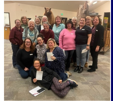
Bunco nights are a blast!

With the holidays over and the new year starting to bloom, things are starting to speed up again in the County. The beginning of the year is an amazing time to pick up a new hobby, and the nature centers have been a great place to do so! Fishing, indoor gardening, & bunco are just a few of the things that have been offered this year so far. Did you miss this season's Bunco night? Don't worry! Bunco nights occur each season and switch between Fountain and Bear Creek Nature Centers. The next bunco night will be at Fountain Creek Nature Center on April 19 th . With spring approaching, Paint Mines Interpretive Park and Rainbow Falls Historic Site will also be coming alive with activity as the first spring programs are rolled out. On March 9 th you'll get a chance to photograph Rainbow Falls during winter with our partner 3 Peaks Photography as we take two groups up to the falls for a photography workshop. Interpreters at Paint Mines will start their season in April and will kick off the hiking season with a wildflower walk on May 31 st . Don't let the end of winter and beginning of spring slip by. Catch you next time with more updates from recreation services! 🐾