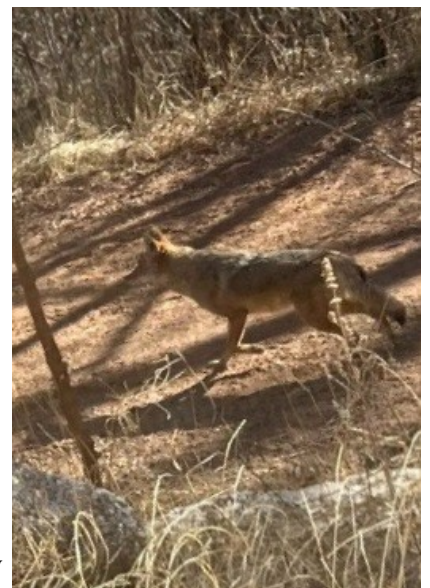
A coyote scampers past Bear Creek Nature Center's windows.