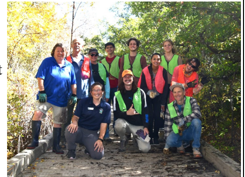
Many hands make light (and fun) work.

As stewards of the park, staff and volunteers created the Restoration Crew. This group focuses on fire mitigation leading to habitat restoration. Fire is another element of a healthy foothill's ecosystem, clearing out old debris. Suppression of fire led to a plethora of tree limbs. This debris creates more fuel and a hotter fire. Many trees are adapted to withstand the temperatures of a normal fire, but greater heat levels will kill the tree. Clearing debris from the park creates cleaner and healthier habitats for all wildlife and reduces the risk of fire becoming out of control. If you'd like to join the Restoration Crew at Bear Creek, please contact Kylee Taylor at kyleetaylor2@elpasoco.com . We conduct quarterly workdays with varying activities, so all are welcome and able to become stewards of our beautiful park. 🐾