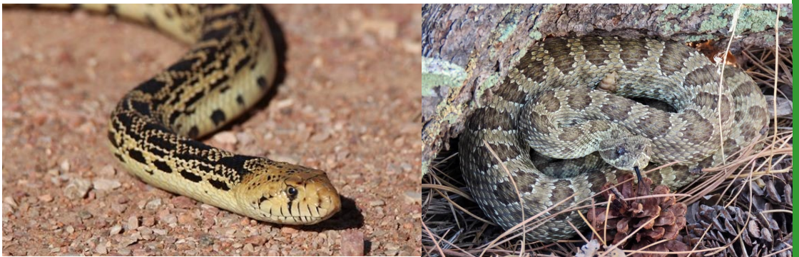
Left: Non-venomous Bullsnares are found in most of El Paso County. They are yellow-gold with dark brown patterns. Right: Prairie Rattlesnakes range in shades of dusty yellow, olive, and gray with darker gray-brown patterns on their back. (not in a EPC Park).

This is a nature center, so we don't want to kill it, nor do we particularly want to fully relocate it. So, we waited till it was out of its hole, then filled in the burrow, so it had to choose another hole. It has not been spotted since... 🐾