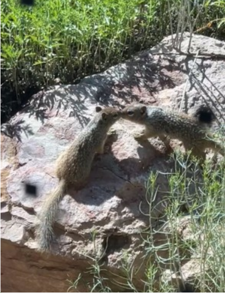
FCNC staff has been watching the rock squirrel kits grow bigger and roam farther from their rock den.

One of the highlights of the summer for the Fountain Creek Nature Center staff was being able to watch a mother rock squirrel raise her litter of at least seven babies right outside of the office windows. From just poking their heads out of the rocks waiting for mom, to now being off on their own looking for food, we have gone nuts for these babies.