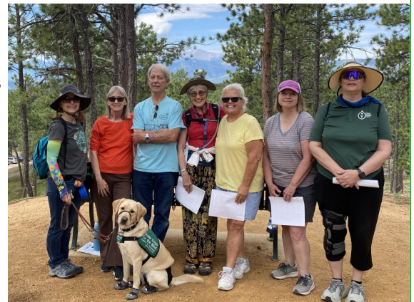
Volunteers socialize and admire the nature of Fox Run Regional Park.