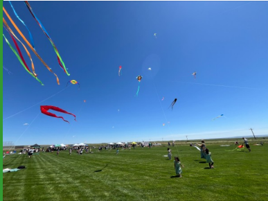
The sky at Falcon Regional Park filled with kites!

Summer was packed with fun and adventure across El Paso County Parks! The highlight of the season was the 4th Annual Kite Festival at Falcon Regional Park on July 14. With perfect weather and over 550 attendees, the event was a soaring success. Be sure to catch it again next summer! Archery Camp returned for another great year, with full sessions and a popular Free Archery Day giving