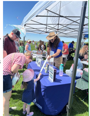
Above & Below: Kite Fest attendees make kites to fly.

ahead, we're excited for Paint Mines hikes, Rainbow Falls photography workshops, seasonal Bunco nights at Bear Creek and Fountain Creek Nature Centers, and Take a Kid Mountain Biking Day. Stay tuned for more fall fun! 🐾