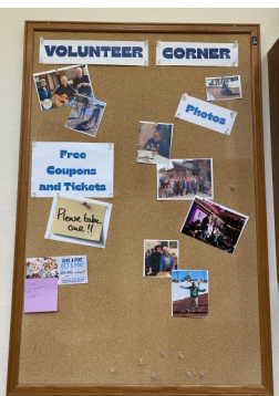
Volunteers, check out the Volunteer Board next time you're at BCNC!