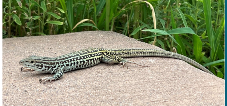
Checkered Whiptail lizards seemed to be prominent at Fountain Creek Nature Center this summer.

This summer has been full of changes due to increased rainfall. One interesting observation Fountain Creek Nature Center staff have made is an uptick in Colorado Checkered Whiptail ( Aspidoscelis neotesselatus ) sightings. While we can't know for sure if this is due to the increased rainfall or perhaps just because our staff has spent more time outside this summer, we do know that it has been awesome observing these fascinating lizards! Colorado Checkered Whiptails are native to southeastern Colorado and the species developed as a hybrid between the Common Checkered Whiptail ( Aspidoscelis tessellatus ) and the Prairie Racerunner ( Aspidoscelis sexlineatus viridis ). This hybridization led to them being triploid, or having three sets of chromosomes, and means that every individual is female! These ladies reproduce asexually using a process called parthenogenesis in which the eggs are fertilized without male gametes. The offspring are genetically identical to their mothers! Next time you pass one on the trail, (quietly) say hello to the little lizard lady. 🐸