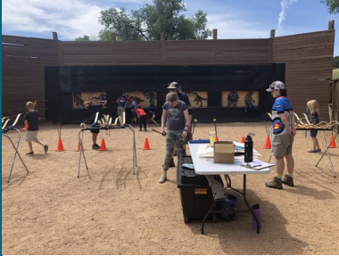
Archery Camps at Bear Creek are a blast!

It is that time of year again. The time when the days start to get shorter, temperatures start to drop, and life of summer starts to go into its dormant stage. Fall is just around the corner. Here is a glimpse into what has been happening this summer in and around your regional parks.