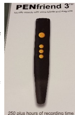
PENfriend devices can be borrowed from Bear Creek Nature Center