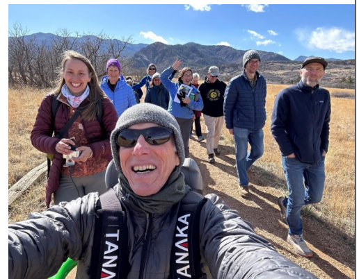
Volunteers were ready for the 2023 Trailability Program season.