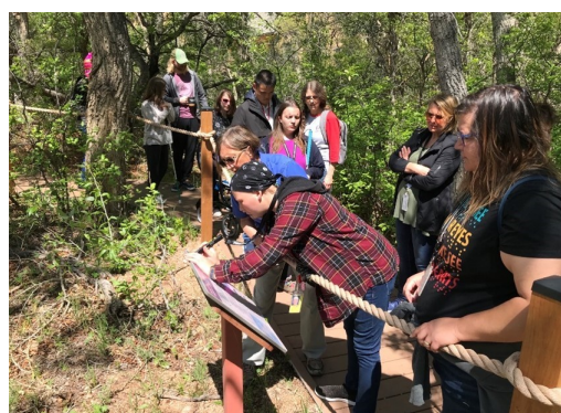
Students from the Colorado Deaf and Blind School experience the VIP trail.

audio." We purchased two "Pen Friends" and recording began. Recordings of all the signs along Songbird Trail and in our Habitat Exhibits were created.