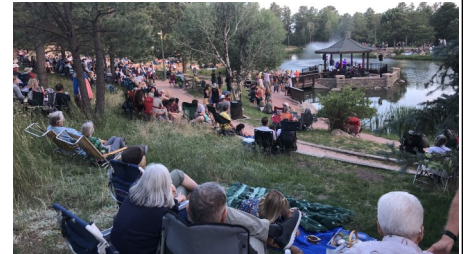
Concerts in the Park celebrates great music in the great outdoors

Archery Camp was five weeks of success, with each camp completely filling up. One thing that was especially exciting was that the weather always cooperated, shockingly, allowing for every camper to get the maximum amount of time out at the range.