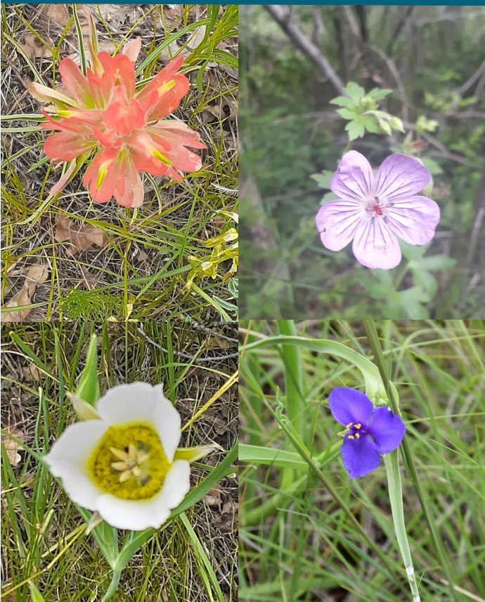
Clockwise from bottom left: Mariposa Lilly, Indian Paintbrush, Wild Geranium, and Spiderwort