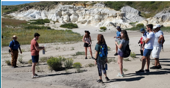
Interpretive Naturalists at the Paint Mines enhance learning opportunities.

Paint Mines Interpretive Park yet again has been a beehive of activity this summer. With the amazing rains we have received, the wildflowers have been otherworldly.