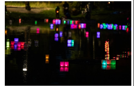
This year's Lights Festival was fun, bright, and colorful!

people through the amazing formations while doing interpretations on the geology and the human history of the area. This, of course, is in addition to the 1289 people they interacted with during their regular patrol of the site. Stay tuned for more fun recreation events from Recreation Services! 🐾