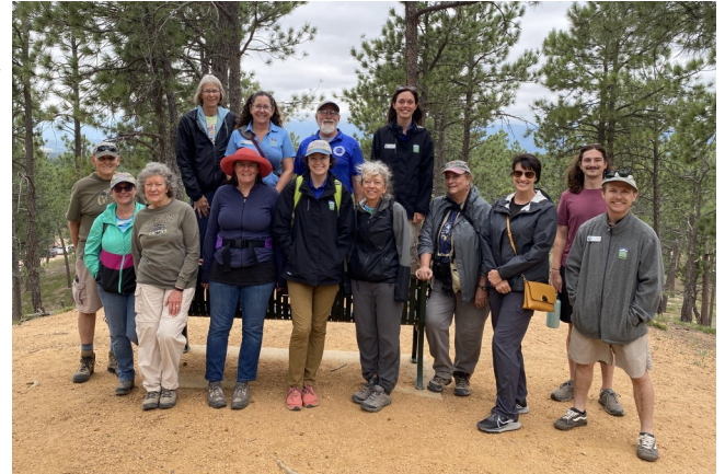
Staff and volunteers took a hike in Fox Run Regional Park to explore plants, animals, and locations to teach about during programs!