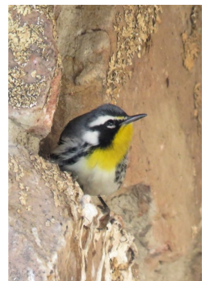
Rare birds, like this Yellow-throated Warbler, benefit from the resources near the Nature Center.