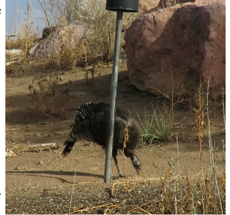
In the fall, hens and "teenage" poults are most commonly seen.

They often make their appearance around the Nature Center once again around October or November. Do they know that they are safe from hunting here and the Nature Center will protect them from becoming someone's Thanksgiving dinner? As winter is making its approach and food is getting harder to find in the woods, perhaps they have learned that there is a readily available supply of food at Fountain Creek Nature Center's bird feeders. 🦃