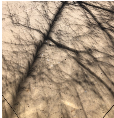
Shadows were obscured by the crescent-shaped light beams.

T hough no official program took place on October 14 th at Bear Creek, staff, volunteers, and visitors stood on the back patio in awe of our cosmos to view the partial solar eclipse. During a partial solar eclipse, the moon moves between the sun and Earth, blocking the sun until a small crescent