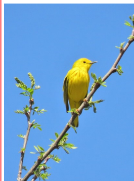
Yellow Warblers sing "sweet, sweet, sweeter than sweet" all summer around the wetlands.

Year-round, a variety of birds await you. Winter is filled with waterfowl and sparrows - you'll find ducks and geese aplenty on the ponds and in the creek, and sparrows flooding the feeders and bushes. Spring brings birds migrating to or through Colorado, and perhaps some that flew the wrong way! Summer sounds include baby birds chirping and parents singing. Fall offers migration excitement once again, and the arrival of wintering birds.