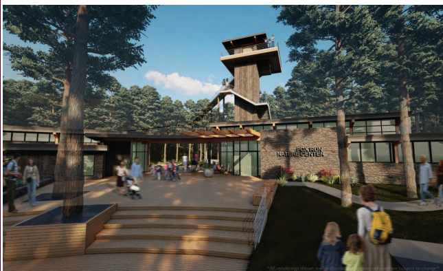
The Fox Run Nature Center will fit into the landscape while offering the same great facilities and programs as Bear Creek and Fountain Creek.

The arrival of summer brought a flurry of excitement as we embarked on a mission to engage our local community in a transformative project – the development of a new nature center. This center, with a mission as an investment in future generations to inspire and create stewards of nature in the Pikes Peak region, is a testament to our commitment to a sustainable, eco-conscious design. To ensure the center resonates with the needs and desires of our community, we initiated a series of outreach opportunities during the summer, inviting people to provide feedback and actively participate in shaping the project's direction.