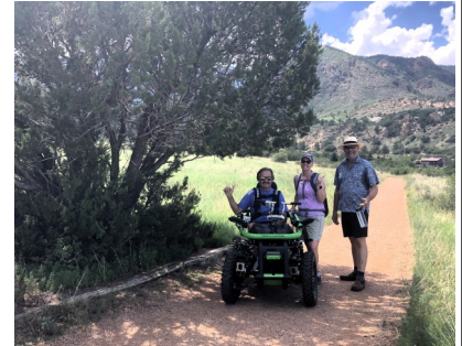
The Trailability Program rolled into its second year, winning hearts and three awards

Over the past five years, southern Colorado has witnessed an extraordinary population growth, over 10% annually. As people are drawn to the area's natural beauty, we are moving forward and building a new, northern nature center in Fox Run Regional Park so everyone in El Paso County will have access to places where fun learning happens. We can make the northern nature center a reality and have a positive impact in El Paso County. But not without your help. 🐾