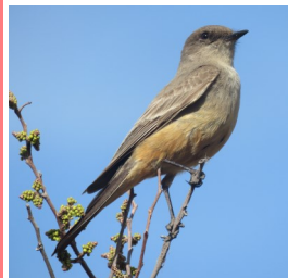
Say's Phoebes are a common sight at the nature center spring through fall.

I may be biased, but Fountain Creek Nature Center and Regional Park is the best birding location in El Paso County. Nearly 300 bird species have been documented in the park, not surprising thanks to the mix of pond, wetland, creek, woodland, and meadow habitats. Add on miles of comfortable, free, public walking trails and the bird feeders at the nature center, and a formula for great birding is written.