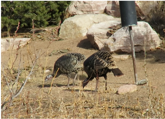
The local turkey flock visits the nature center bird feeders year-round.

T urkeys are back at Fountain Creek Nature Center. While turkeys are not an unusual site here at the Nature Center, they are seen more often in the late fall or spring and early summer. In the spring and summer, turkeys will nest and raise their young. Often several hens will group together to share in the care and protection of their poults. During the summer, they tend to disperse into more sheltered areas in the woods.