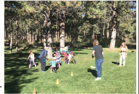
Kids learn to ride safely at the annual Take-a-Kids Mountain Biking Day.

This Fall has been one of the busiest times ever for Recreation Services! In total, 11 programs and events occurred during the month of October alone. Starting the Fall season, the September Lights Festival was a new and fun spin on the traditional Lantern Festival. Colorful LED lights were used, creating a fun and uplifting atmosphere. We started October with National Take-A-Kid Mountain Biking Day, which occurs every year on the first Saturday of October at Fox Run Regional Park. Fifty-five kids learned about mountain biking and went for a guided trail ride. In addition, over $1000 of donated biking swag items was given away to the aspiring riders, a new record high for the event. Another record was set for the month of October at Paint Mines Interpretive Park, where four different programs were executed, with the interpreters leading over 80