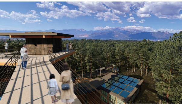
An accessible canopy walk and tower will help connect visitors to the Black Forest, Palmer Divide, and other unique characteristics of the region.

Outreach at community events included the State of the Outdoors, concerts in the park, Get Outdoors Day, Black Forest farmers market, Panorama Park Backpack Bash, and more. Participants provided feedback on what they like best about nature centers, what features, programs, and opportunities they would like to see, and obstacles preventing them from visiting nature centers.