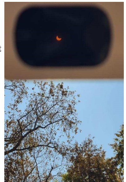
Glasses made it safe for staff and visitors to watch the magic.

Areas further south of Colorado Springs were lucky enough to see a total eclipse, when the moon fully covers the sun to create a "Ring of Fire" in which solar glasses may be removed and the sun can be viewed safely for a brief period of time. The next partial solar eclipse viewable in Colorado is April 8, 2024! 🐾