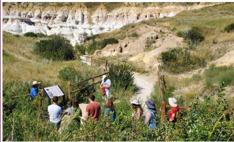
The Paint Mines are a beautiful place to enjoy cooler days.

people through the amazing formations while doing interpretations on the geology and the human history of the area. This, of course, is in addition to the 1289 people they interacted with during their regular patrol of the site. Stay tuned for more fun recreation events from Recreation Services! 🐾