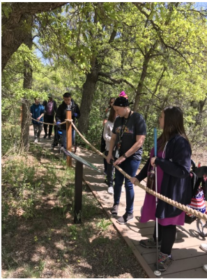
Bear Creek's VIP Trail and Fountain Creek's Audio Tour have helped create more connections to the outdoors.

Our popular Trailability Program, which provides trail access via all-terrain vehicles to those with disabilities, has been nationally recognized; receiving a Universal Accessibility Award from the National Association of County and Park Officials , an Achievement Award from the National Association of Counties and a Columbine Award in Programming from the Colorado Parks and Recreation Association .