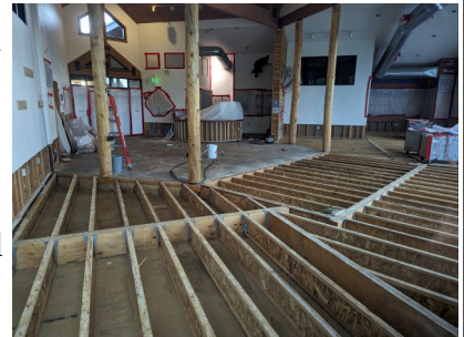
Fountain Creek Nature Center closed for over two months, but staff continued all-outdoor programs and nature camps.